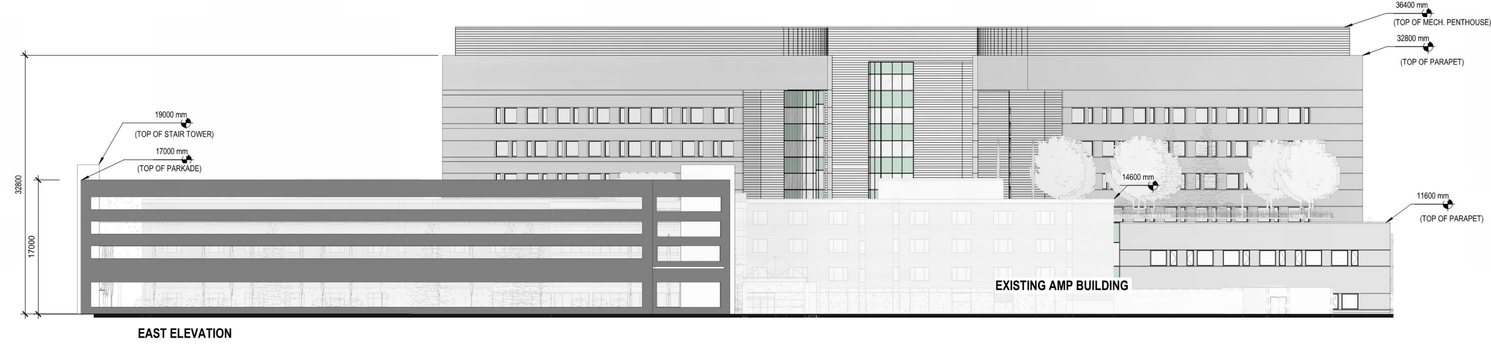
1 EAST ELEVATION SCALE: 1:300