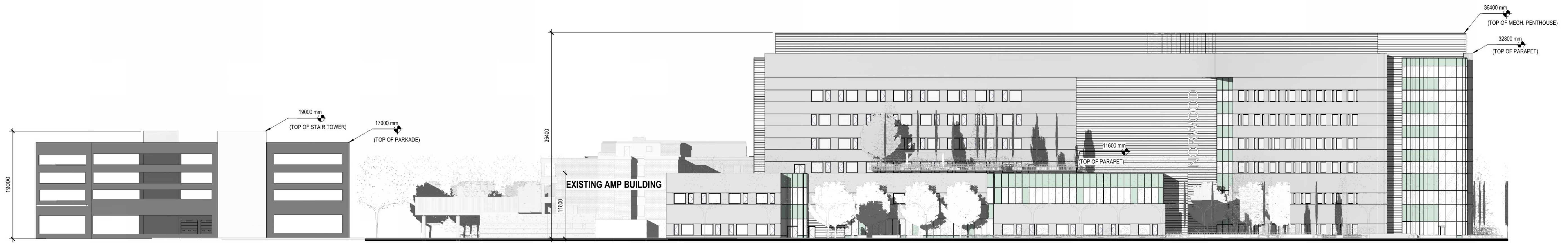
2 DP_NORTH ELEVATION SCALE: 1:300